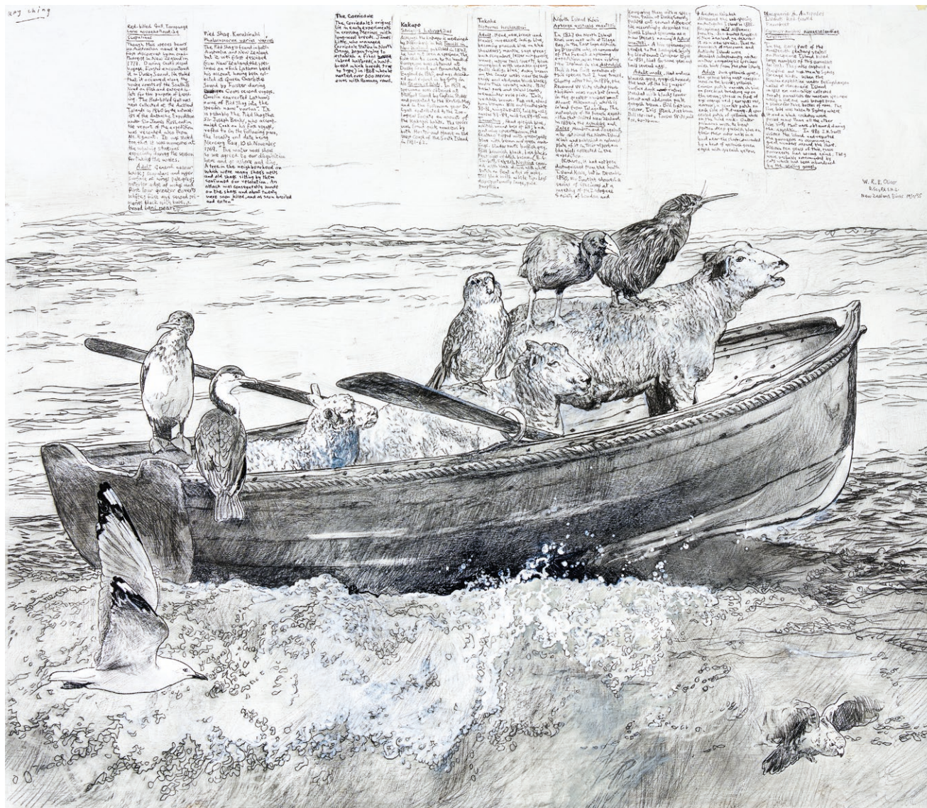
Delegation from Aotearoa

Graphite pencil, ink, conté, carbon, oils, liquin on board 915 x 1095 mm